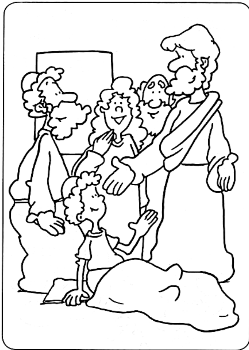
Jesus took him by the hand and lifted him up.