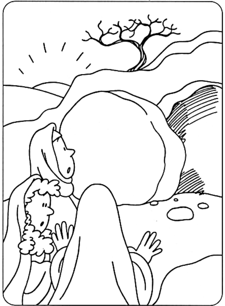
They found the stone rolled away from the tomb. Luke 24:2