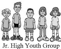
Jr. High Youth Group