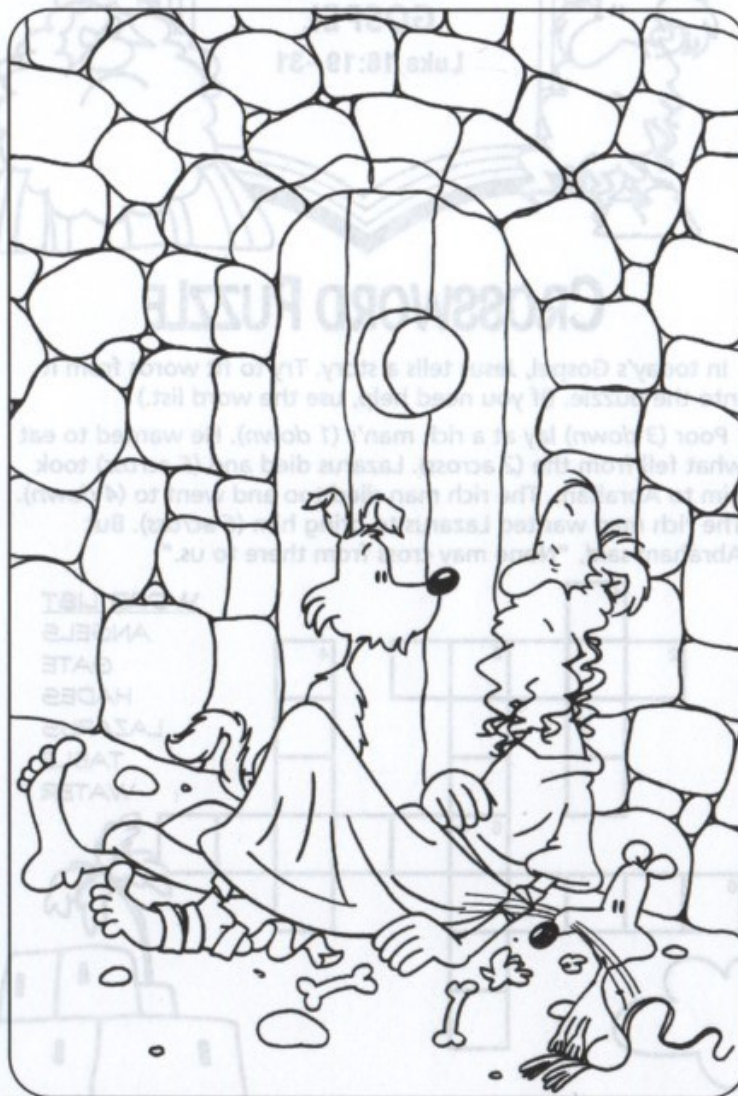
At his gate was laid a poor man named Lazarus. Luke 16:20