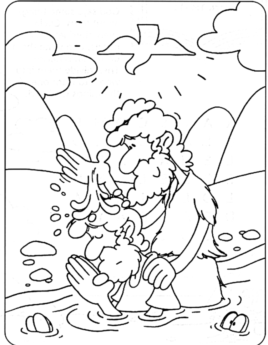
Jesus came from Nazareth of Galilee and was baptized by John in the Jordan. Mark 1:9